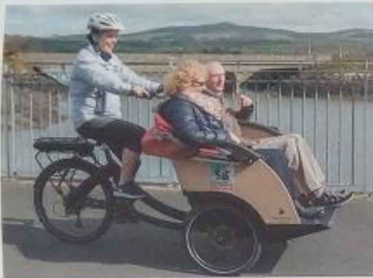
Trishaw in Action